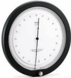
Model CM 350° dial arc