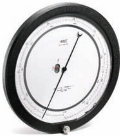
Model CMM 660° dial arc