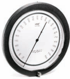
Model CC 300° dial arc